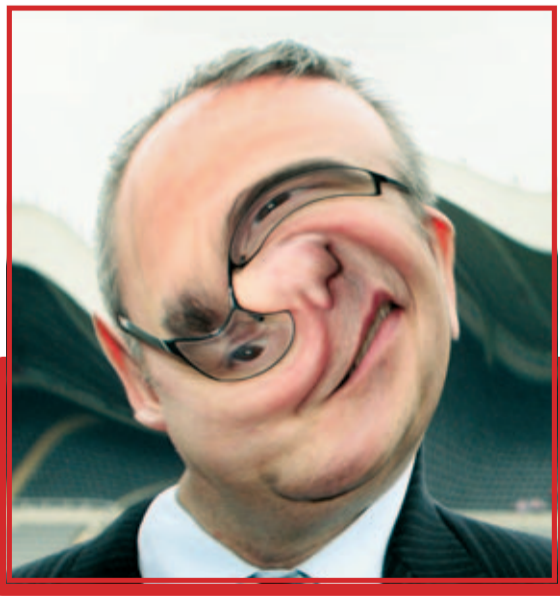
GUESS THE CELEBRITIES ANSWERS: 1 Jerry Orbach, 2 Heather Mills McCartney, 3 Joseph Heller, 4 Brenda Strong, 5 Desmond Tutu, 6 Lena Zavaroni.

TV host Fiona Bruce, 44, says she's terrified of ageing and fears that, when she gets too old for TV, she'll be axed. She said: "There are days when I look in the mirror and think: 'Urgh, a bit tighter here would be great.'"